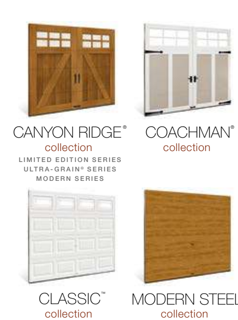
CANYON RIDGE® collection LIMITED EDITION SERIES ULTRA-GRAIN® SERIES MODERN SERIES

QuietFlex™ hinge is not available on all door heights.